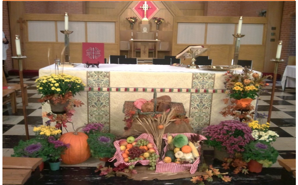
Bring the full tithes into the storehouse... and I will pour down to you an overflowing blessing. Mal. 3:10.